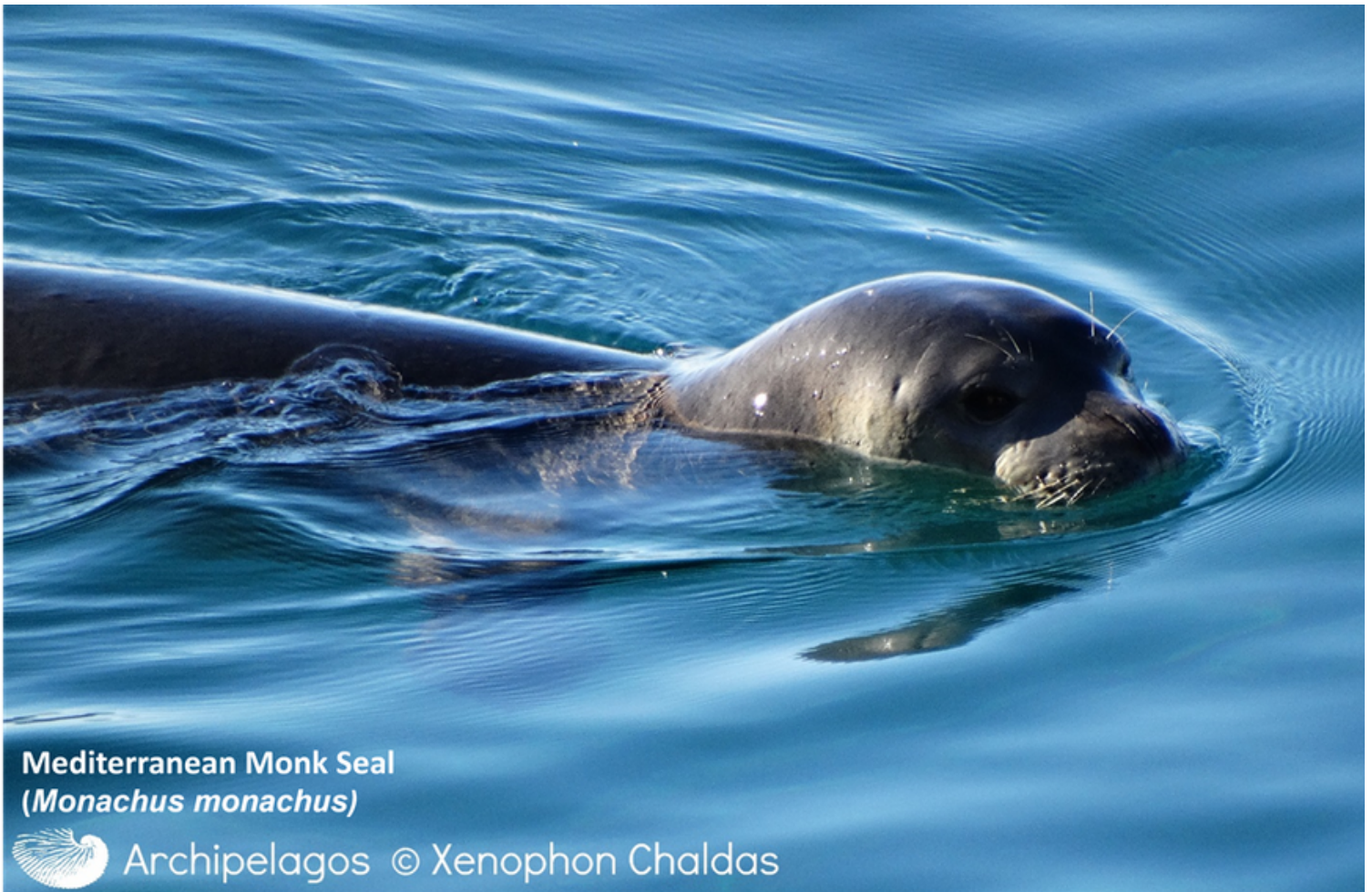
Mediterranean Monk Seal ( Monachus monachus )